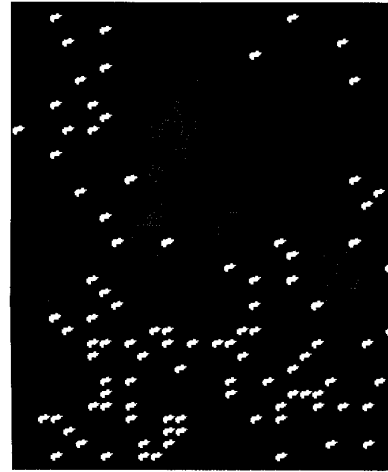
Simulation of bacteria growth process in glucose medium