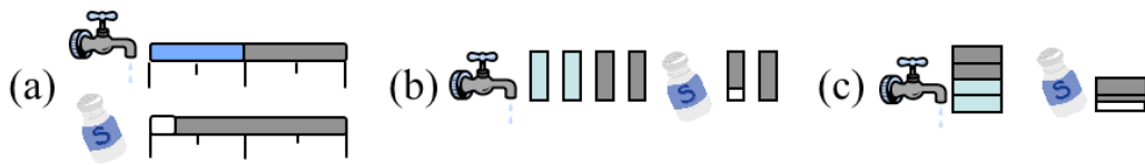
Figure 2. Consumption-Level Icons: (a) Horizontal Icon, (b) Vertical Icon, and (c) Fill-Up Icon.

food similar to how they were taught by their nutritionist, but did not fully understand the categorization.